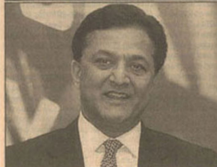
RANA KAPOOR Founder, Managing Director & Chief Executive Officer Yes Bank Ltd.