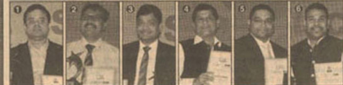
(1) Blue Dart Express Ltd. [BEST OVERALL CSR PRACTICES] (2) Canon India [SUPPORT & IMPROVEMENT IN QUALITY OF EDUCATION] (3) DLF Foundation [BEST OVERALL CSR PRACTICES] (4) Dr. Achyuta Samanta, Founder, KIIT University [HALL OF FAME AWARD] (5) FIINOVATION [CSR TEAM OF THE YEAR] (6) Kalamandir Foundation [BEST OVERALL CSR PRACTICES]