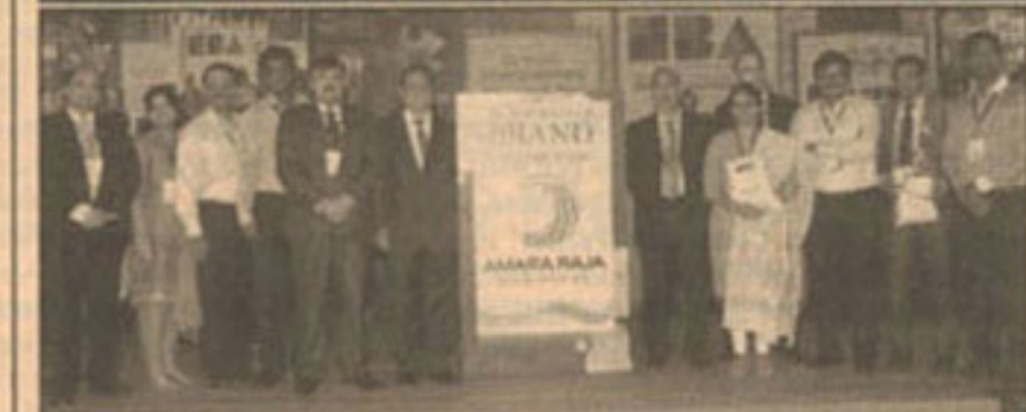
AMARA RAJA GROUP