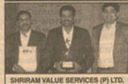
SHRIRAM VALUE SERVICES (P) LTD.