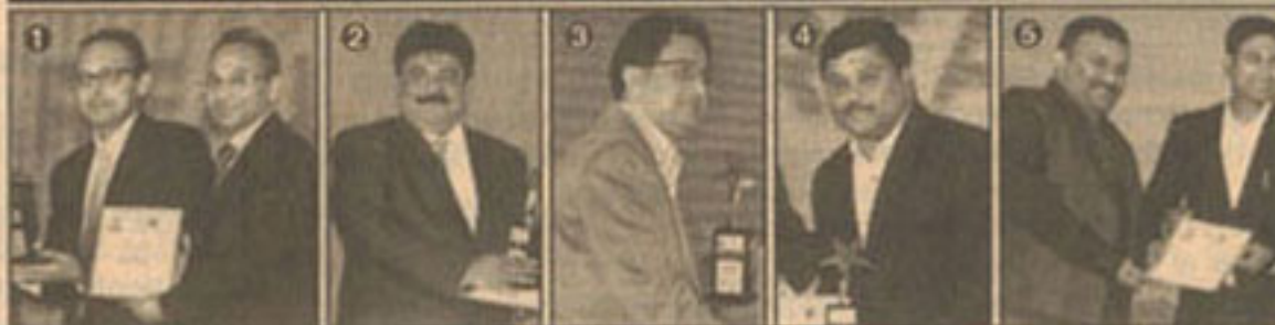
(1) Diamond Heritage - Diamond Group [DEVELOPER OF THE YEAR - COMMERCIAL] (2) GM Infinite E-City Town [RESIDENTIAL PROPERTY OF THE YEAR] (3) Hanging Gardens - Prisha Properties India Pvt. Ltd. [ENVIRONMENT FRIENDLY PROJECT OF THE YEAR - RESIDENTIAL] (4) S & S Foundations Pvt. Ltd. [DEVELOPER OF THE YEAR - RESIDENTIAL] (5) Samskruti Builders Pvt. Ltd. [SUSTAINABLE DEVELOPER OF THE YEAR]